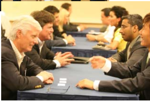
"Speed Networking" paired MSRE students with Advisory Board members for brief introductions